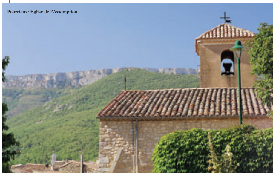
Pourcieux: Eglise de l'Assomption

holes Golf courses are also available (Barbaroux Golf course, Brignoles and La Sainte Baume Golf Course, Nans Les Pins).