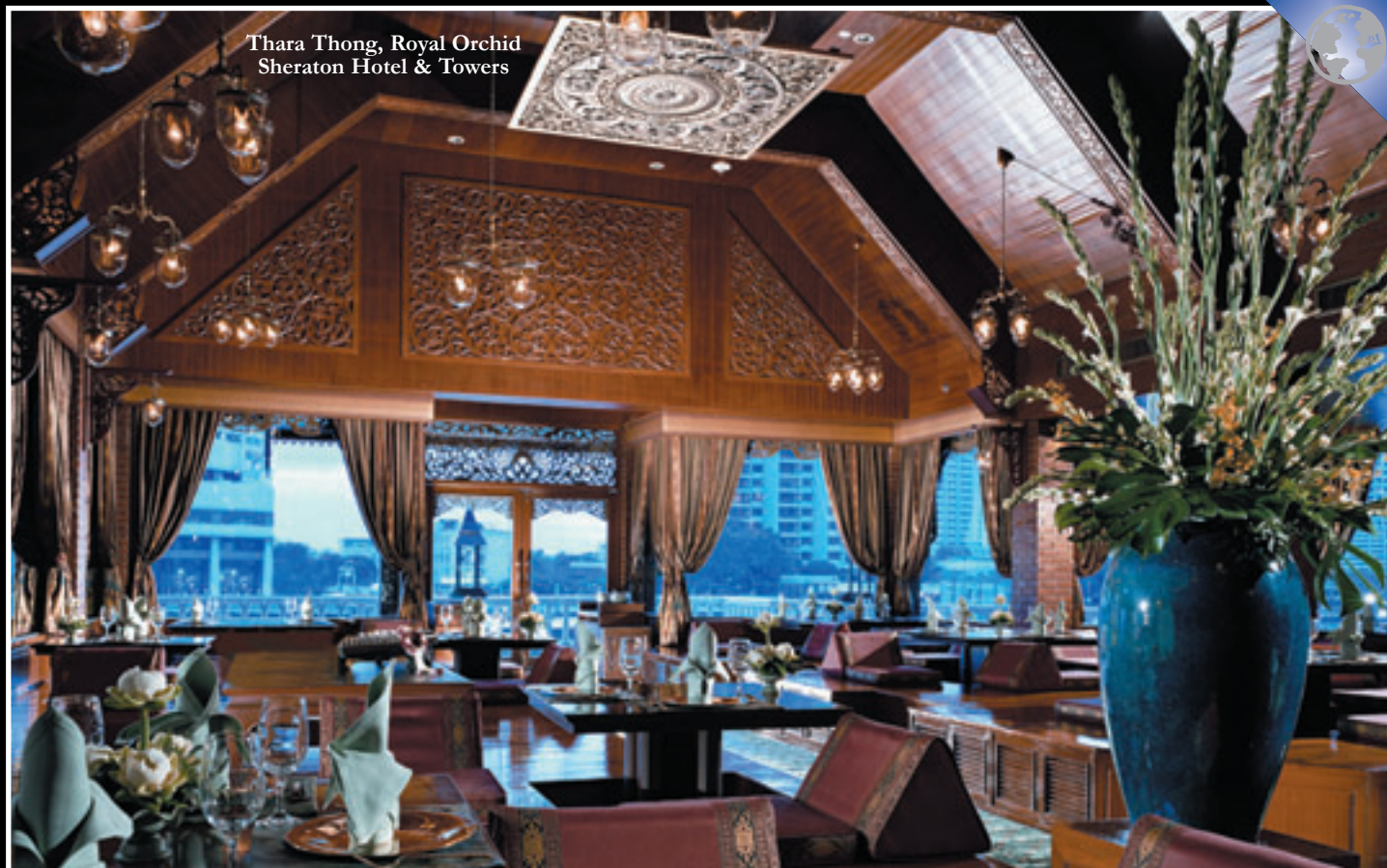
Thara Thong, Royal Orchid Sheraton Hotel & Towers