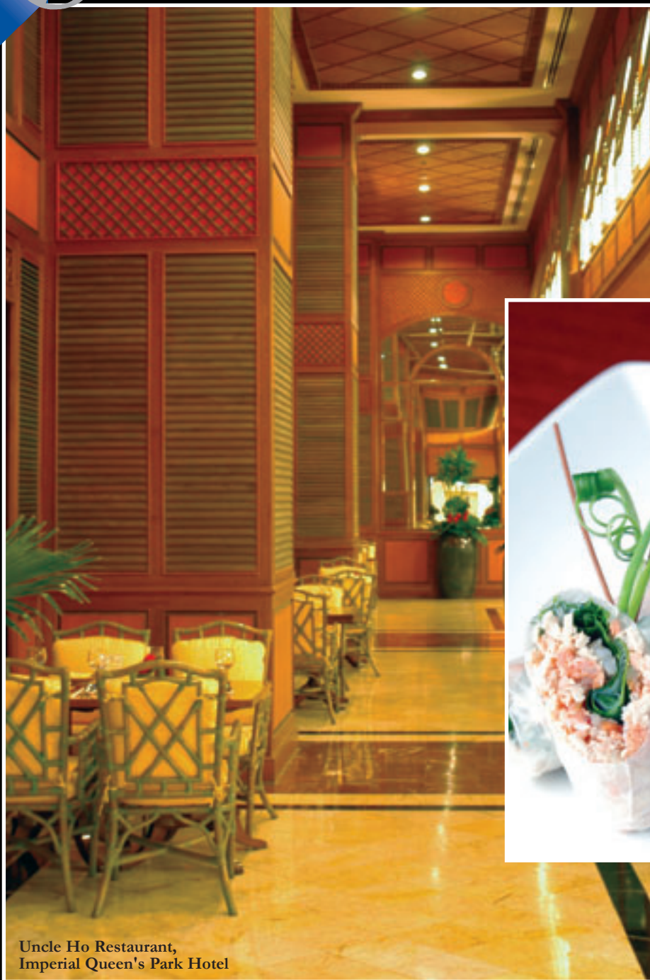
Uncle Ho Restaurant, Imperial Queen's Park Hotel