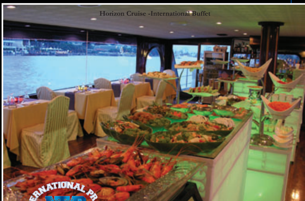
Horizon Cruise -International Buffet

One of the most attractive offers in Bangkok: a romantic evening cruise and dinner. Leaving every