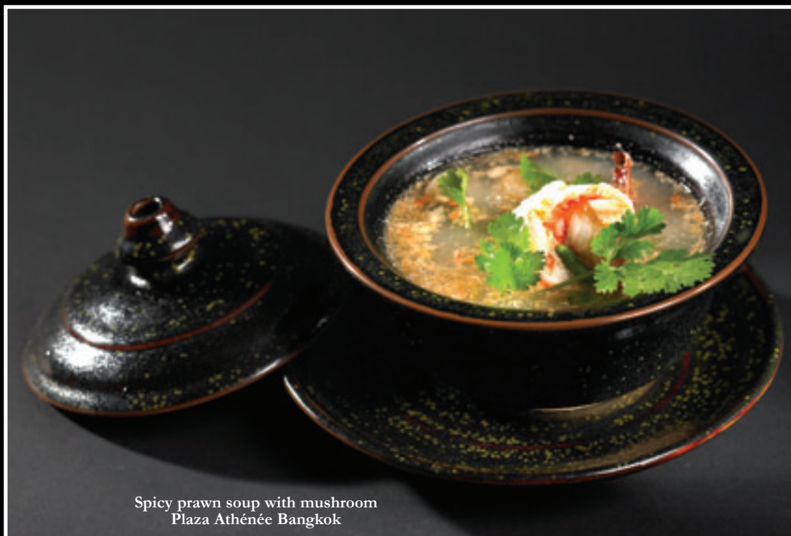
Spicy prawn soup with mushroom Plaza Athénée Bangkok

Offering a truly authentic taste of Thailand. Just step into the restaurant and be welcomed with a warm towel and a choice from many of the herbal drinks such as old-style ginger juice and apple rose. I am sure to have tested the best prawn spring rolls in Smooth