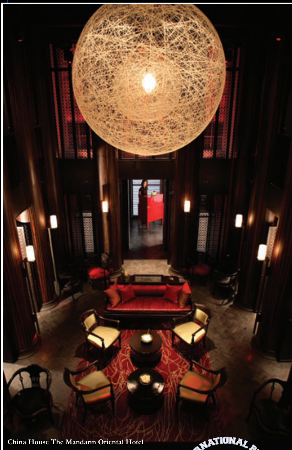
China House The Mandarin Oriental Hotel