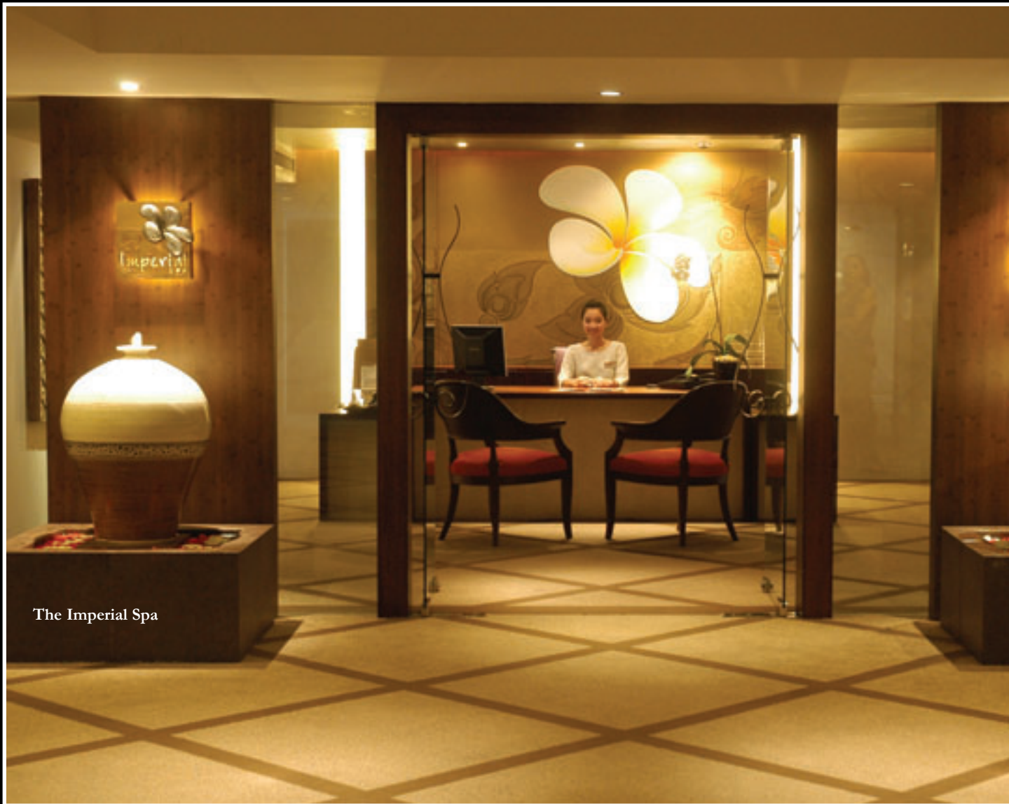
The Imperial Spa

Please note I did not choose Thai spas purely for leisure or recreation but as an objective theasus of my trip to Thailand.