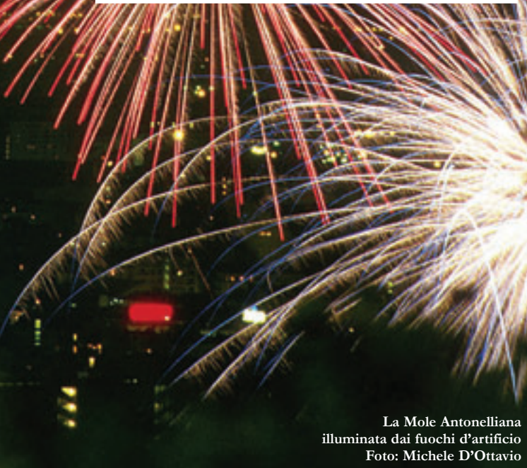
La Mole Antonelliana illuminata dai fuochi d'artificio

workshops, restaurants and coffee shops. This imposing Baroque palace with its extensive gardens, which is one of the most significant examples of stately architecture and art of the period between the 18th and 19th centuries, which today forms a winning blend of ancient splendour and present day creativity. There is also the La Mandria park, one of the finest examples of European environmental protection, which houses a whole range of both wild and domestic animal species, and where it is possible to enjoy trekking, horse-riding and cycling excursions. The splendour of the setting makes this Palace a great and prestigious venue for events, ceremonies, and conventions, not to mention the fact that the best golfing greens in Piemonte are located only a few kilometres away.